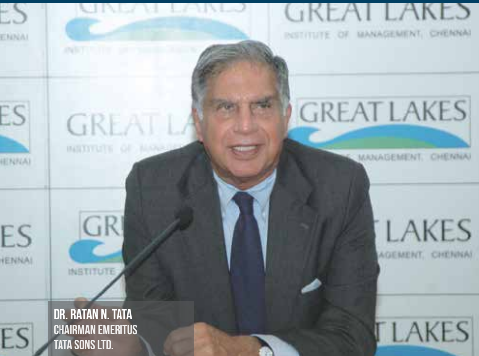
DR. RATAN N. TATA CHAIRMAN EMERITUS TATA SONS LTD.