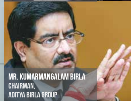
MR. KUMARMANGALAM BIRLA CHAIRMAN, ADITYA BIRLA GROUP