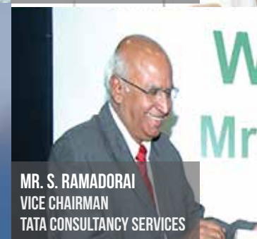
MR. S. RAMADORAI VICE CHAIRMAN TATA CONSULTANCY SERVICES

MR. MADHUR BAJAJ VICE CHAIRMAN, BAJAJ AUTO LTD.