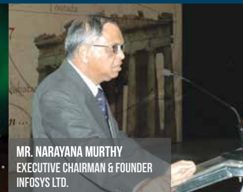
MR. NARAYANA MURTHY EXECUTIVE CHAIRMAN & FOUNDER INFOSYS LTD.