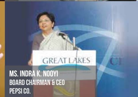
MS. INDRA K. NOOYI BOARD CHAIRMAN & CEO PEPSI CO.