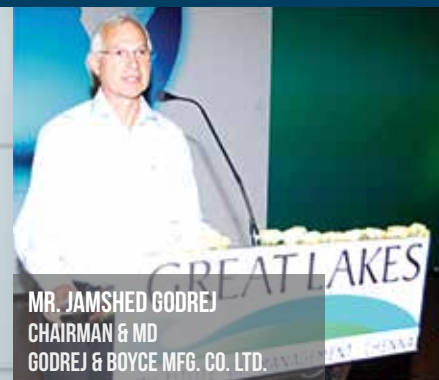
MR. JAMSHED GODREJ CHAIRMAN & MD GODREJ & BOYCE MFG. CO. LTD.