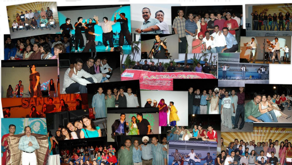
A sneak-peek into the vibrant campus life